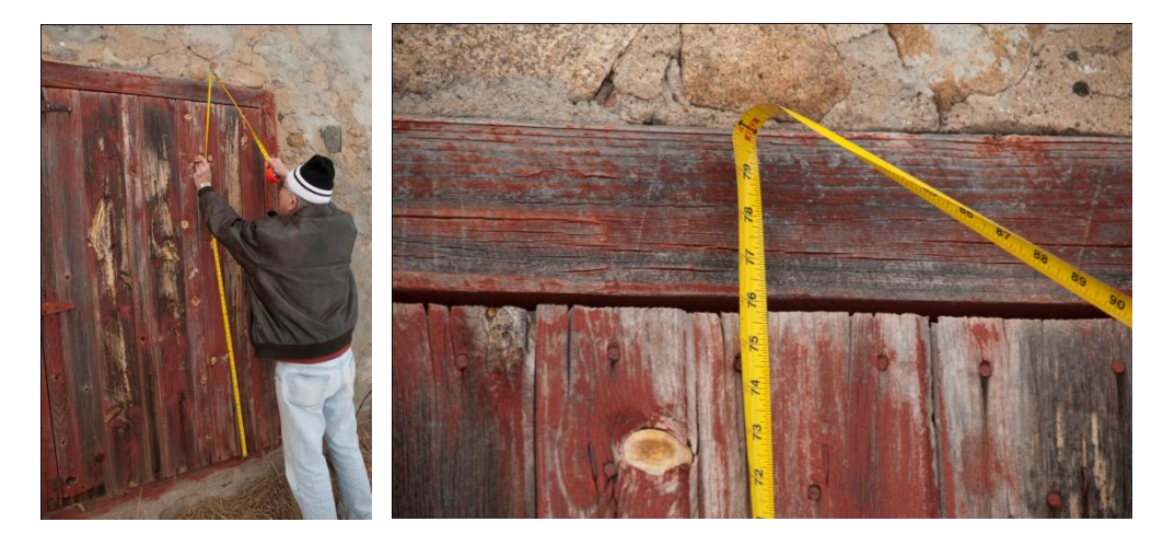
Capture both the frame information and overall size.

At the same time get both structural (in this case a rock wall) and door-frame construction documented. This is generally a two person task.